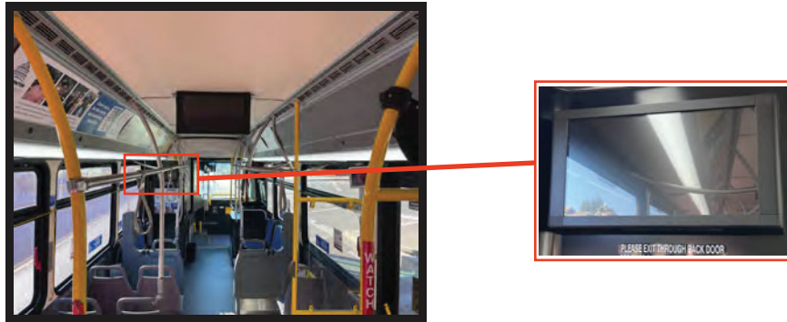
Interior of an electric bus, showing both digital displays

Advertising is available on both digital displays on our electric buses. The displays are positioned behind the drivers seat and in the middle of the bus, the perfect locations to catch all riders attention. The displays run on a 3 minute loop, with 10 second slots available for advertisers. The average rider will see any given ad at least three times per ride.